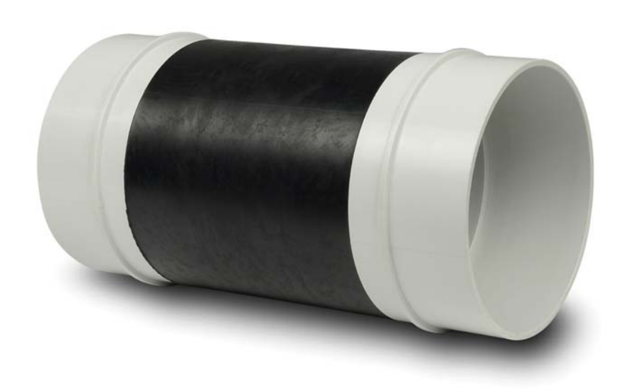
Acting like a shock absorber Flexitec

takes the stress out of fixed and ridged PVC plumbing installations.